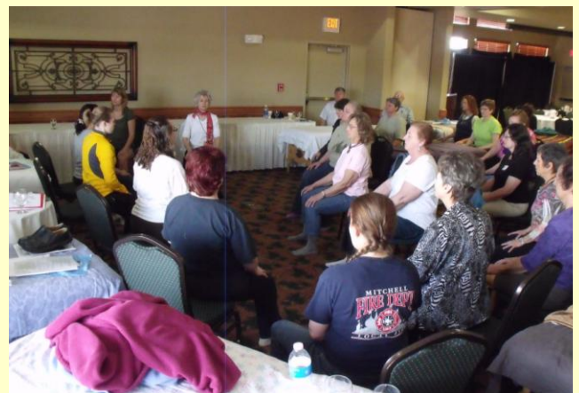
Spring Conference Attendees